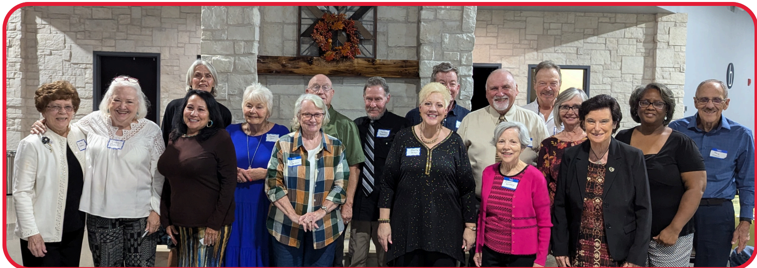
A portion of our group of RLPM Ambassadors took this photo together while the guests continued praise and worship.